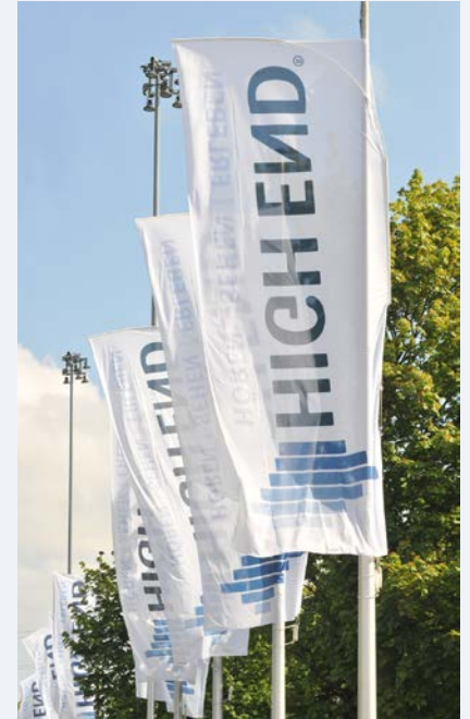
HIGH END signs

Reprints free of charge – specimen copy requested