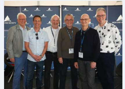
The „Quartet of Critics“ > picture download with Guests at the HIGH END 2017

This Quartet of Critics is a cooperative effort involving the „German Record Critics Award Association“ and the HIGH END SOCIETY.